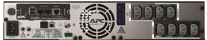
[ SMX1500RM12UNC ]