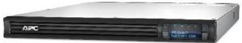
[ SMT1500RM1U ]