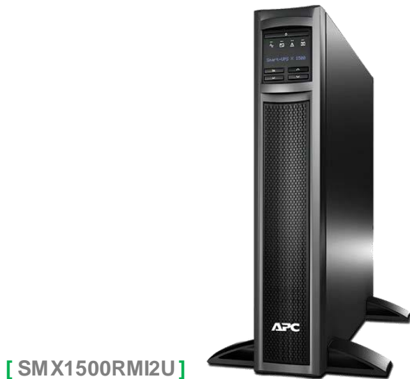
[ SMX1500RM12U ]

Convertible extended run models ideal for critical servers and voice/data switches.