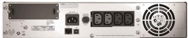
[ SMT1500RM2U ]